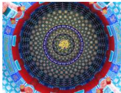
(d) Titulo debitas.