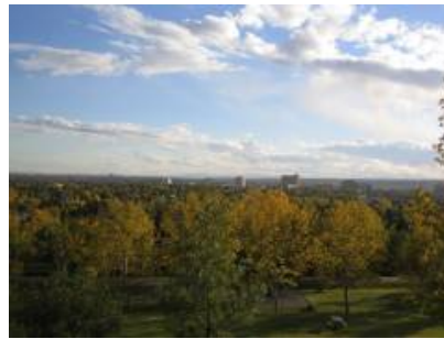
(b) Pan ma signo.