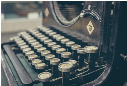
(a) A Typewriter

Lorem ipsum dolor sit amet, consectetur adipiscing elit, sed do eiusmod tempor incididunt ut labore et dolore magna aliqua. Ut enim ad minim veniam, quis nostrud exercitation ullamco laboris nisi ut aliquip ex ea commodo consequat. Duis aute irure dolor in reprehenderit in voluptate velit esse cillum dolore eu fugiat nulla pariatur. Excepteur sint occaecat cupidatat non proident, sunt in culpa qui officia deserunt mollit anim id est laborum.