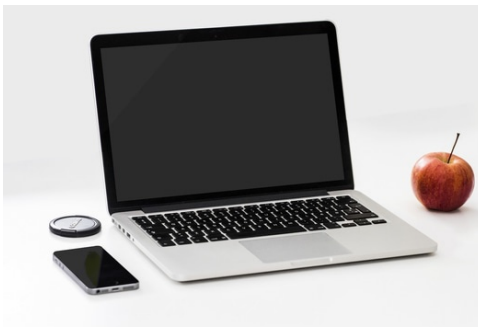
(b) A Macbookpro