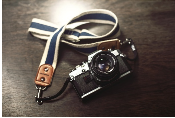
Figure 2.1: A Camera

Lorem ipsum dolor sit amet, consectetur adipiscing elit, sed do eiusmod tempor incididunt ut labore et dolore magna aliqua. Ut enim ad minim veniam, quis nostrud exercitation ullamco laboris nisi ut aliquip ex ea commodo consequat. Duis aute irure dolor in reprehenderit in voluptate velit esse cillum dolore eu fugiat nulla pariatur. Excepteur sint occaecat cupidatat non proident, sunt in culpa qui officia deserunt mollit anim id est laborum.