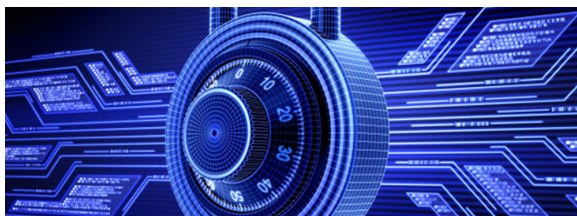
Figure 1: This is my great security design.