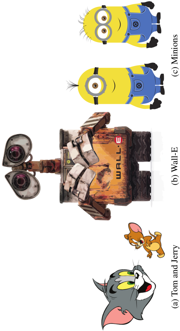
Fig. 2.2 Best Animations