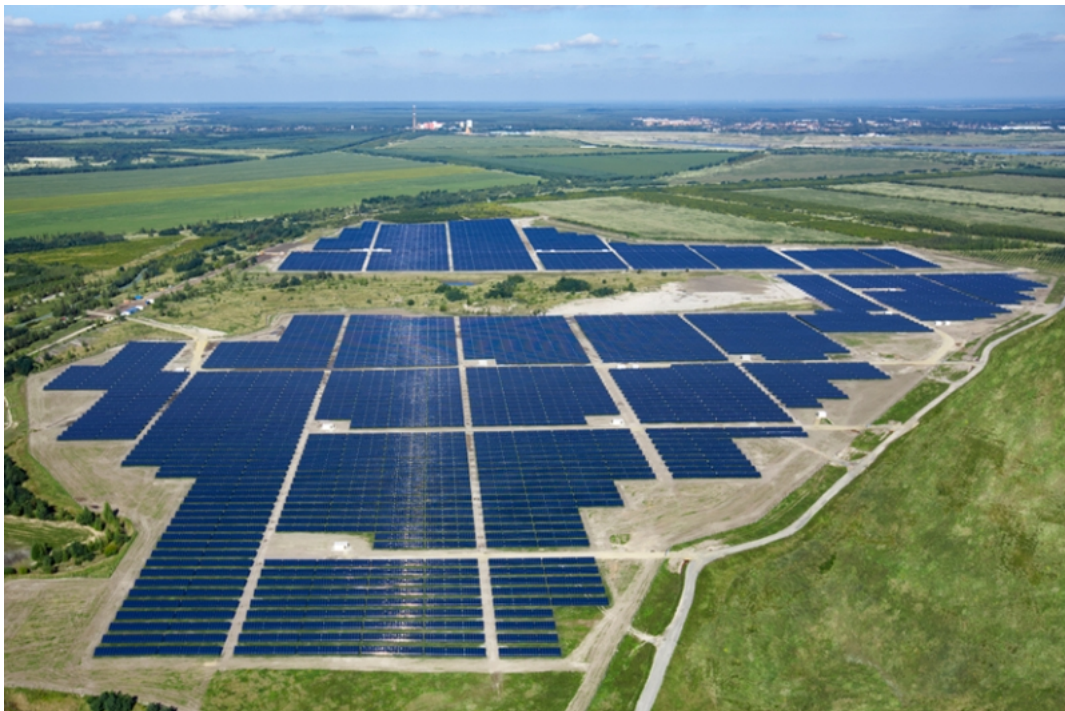
Figura 2: Parque Solar Meuro en Alemanio.

pellentesque augue sed urna. Vestibulum diam eros, fringilla et, consetetuer eu, nonummy id, sapien. Nullam at lectus. In sagittis ultrices mauris. Curabitur malesuada erat sit amet massa. Fusce blandit. Aliquam erat volutpat. Aliquam euismod. Aenean vel lectus. Nunc imperdiet justo nec dolor.