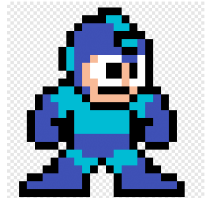
Figura 1: Esta es una figura alineada a la derecha.

Aquí tenemos un Megaman, como se aprecia en la Figura 1. Pero también podemos ver un Protoman en la Figura 2 y para completar la triada tenemos un Zero en la Figura 3.