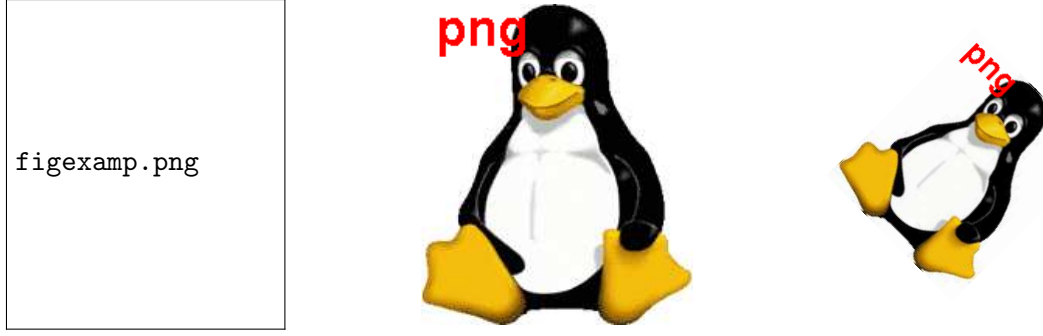
Figure 1 – same figure with draft option (left), normal (center) and rotated (right)