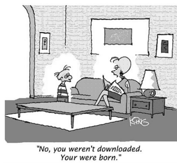
Figura 1. A typical figure

Figure and table captions should be centered if less than one line (Figure 1), otherwise justified and indented by 0.8cm on both margins, as shown in Figure 2. The caption font must be Helvetica, 10 point, boldface, with 6 points of space before and after each caption.