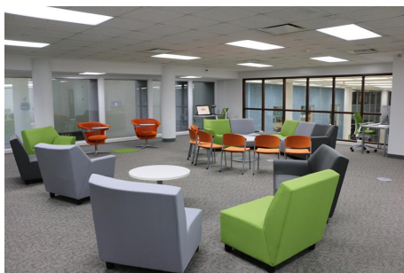
(a) Put your sub-caption here

If you need to place two subfigures in your figure, follow the example below: